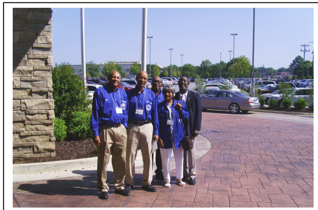
2011 State Convention in Macon, GA May 3, 2011